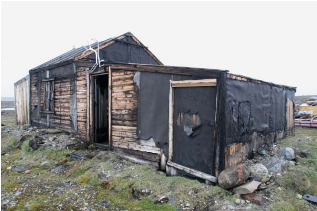
Ottostrand [531] at arrival.