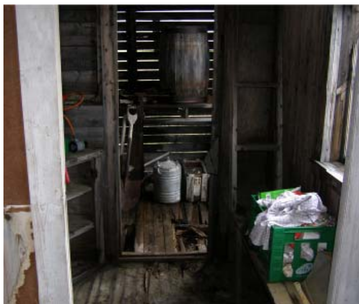
The interior before...

"Agsut" needed a gear oil change, to be loaded and refuelled for yet another trip. Boye sawed acrylic plates on measure for all the windows that were still missing. Once