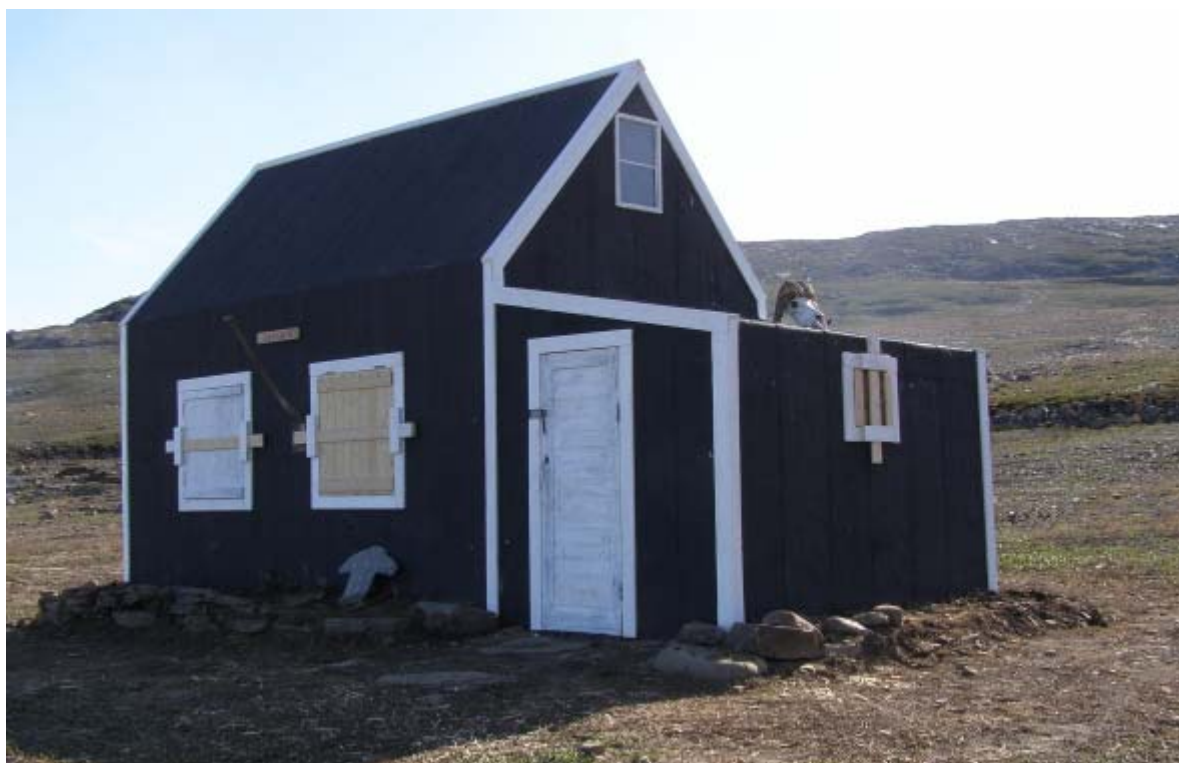
Laplace at departure – ready for use!

glass wire for sealing. A new floor was put in the entre. Boye installed all the new acrylic windows. In the afternoon 4 th August, the weather changed for the better. Then we coved the house with outer felt and painted the boards, preparing them for windows and shutters. The weather gradually cleared up, so we took a walk into the mountains in the midnight sun. On the mountain behind Laplace rivers run in all directions, there had also been quite a few mud slides. Once in a while we went for a dive in the salt water, and for the coal stove