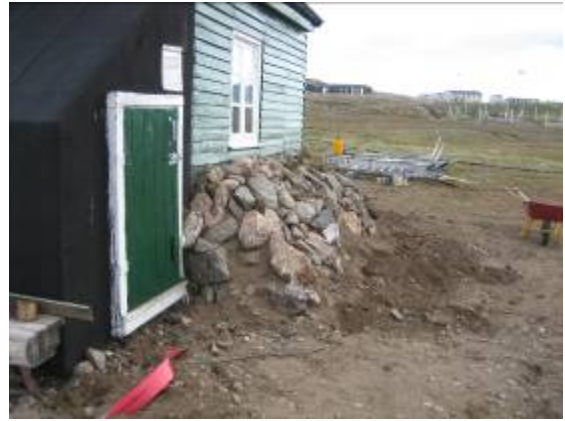
Right: The stone wall was rebuilt and the renovation completed.

seriously wet and rotten wall was exposed; among other things the head was rotten. We succeeded in rebuilding a new board wall, which we afterwards covered with two layers of roofing felt putting it under the lower boards. With more help from Sirius with the big stones, the stone wall was then re-established and covered with stones from the surroundings.