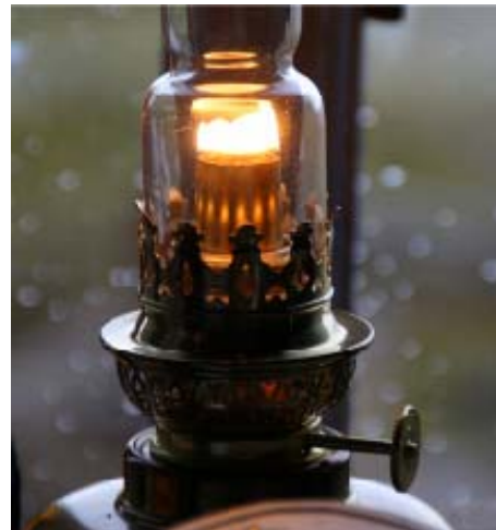
For a while there is once more life, light and evening cosiness in Ottostrand.

After two weeks at Ottostrand the work on the house finally was finished on 9th August. The sign from 1932, which we had carefully removed at beginning, was now put above the doorway along with two antlers that for so many years have been characteristic of Ottostrand. The hut is now standing very usable and in a condition to make it last for another couple of centuries in North-East Greenland.