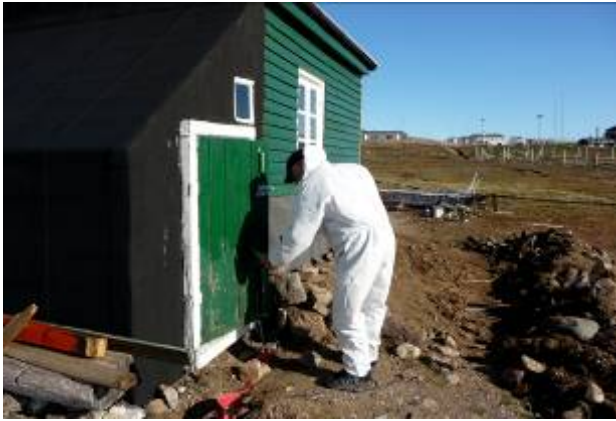
Left: All exterior green and white woodwork was painted.