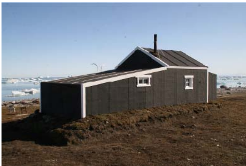
Left: Window after restoration. Nanok-men make an effort to repair and maintain as much of the original building parts as possible. Right: Ottostrand after restoration.