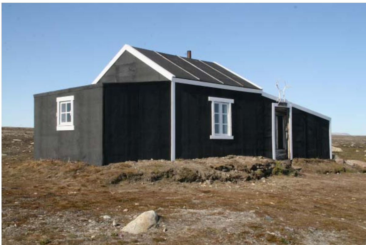
Ottostrand [531] newly restored at departure.

for their help with lay out of materials in 2008 to “Arina Arctica”, for helicopter support and to the Sirius-men for their help. It was wonderful to again experience the coastal spirit and find that it is very well indeed! A special thanks to the board of Nanok for their work and support.