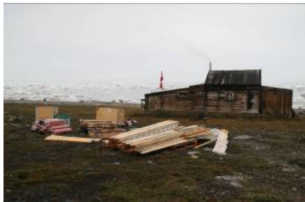
Left: The backside of the station before the renovation. Right: In the summer of 2008 Nanok had laid out a great quantity of materials for the renovation of Ottostrand. For the transport we got kind help from the Navy vessel "Vædderen".

scarcely used by Sirius who preferred to use the Mønstedhus station only 10 km. further north. Sadly Mønstedhus was taken by the sea in the autumn of 2002, but thereby raised another good reason to renovate Ottostrand, which gradually had decayed.