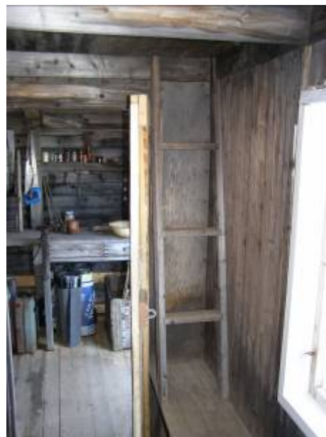
... and after renovation