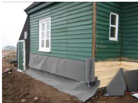
Right: The wall is boarded with roofing felt.