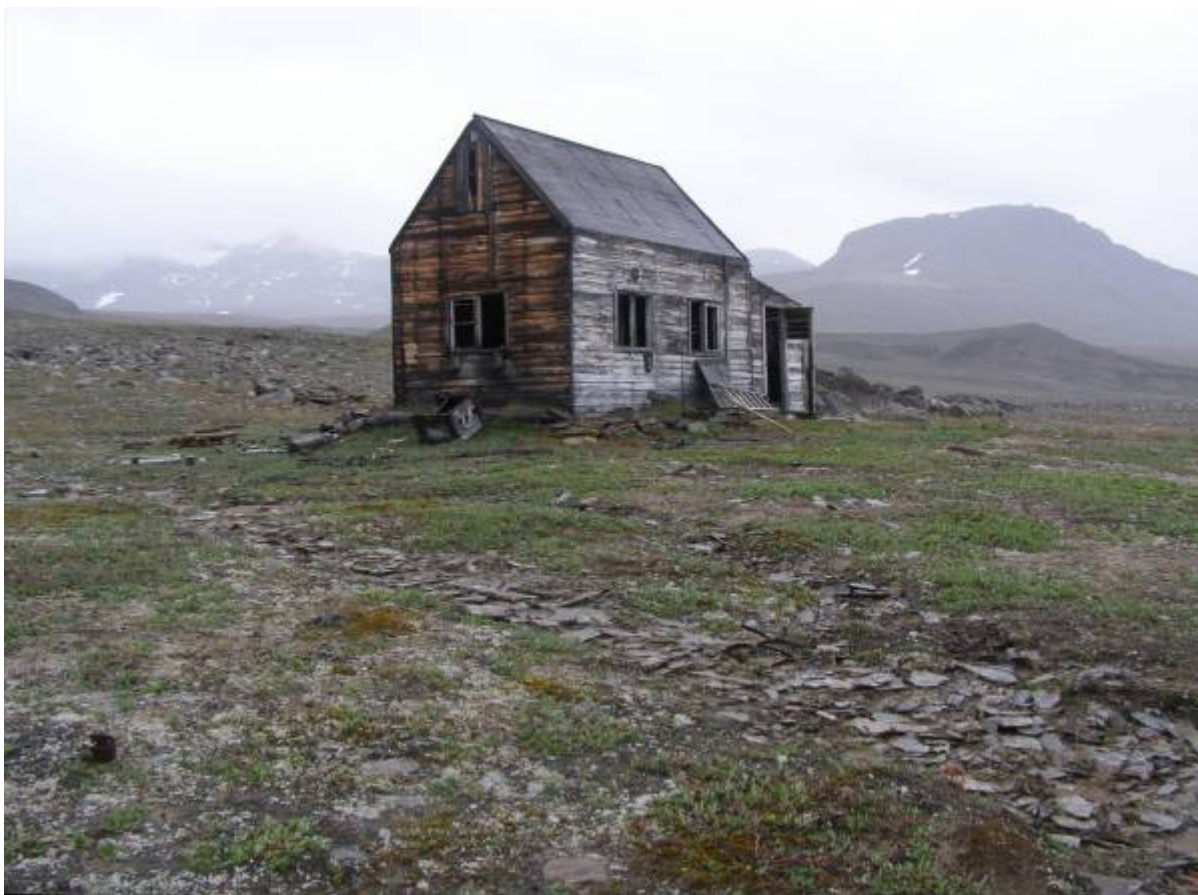
Laplace [301] at arrival.

close to land, we saw quite a few musk oxen, geese, terns, seagulls and ducks on Geographical Society Ø.