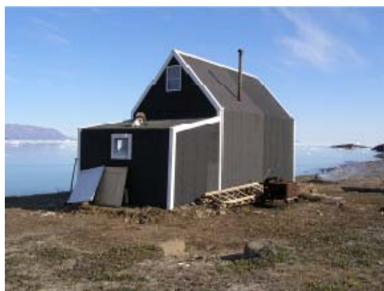
Laplace after restoration.

Remedies from the trappers' era and the early Resolut/Sirius years have been put back in place at the station, and the old stove has been placed nicely in the back of the house.