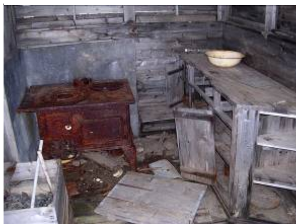
The interior before renovation.

without roofing felt for more than 30 years. We stepped right through the floor and plinth wood could barely be spotted. No windows/glass. The stove had crumbled away. The porch on the south side of the station was not possible to renovate, but it can be rebuilt if necessary.