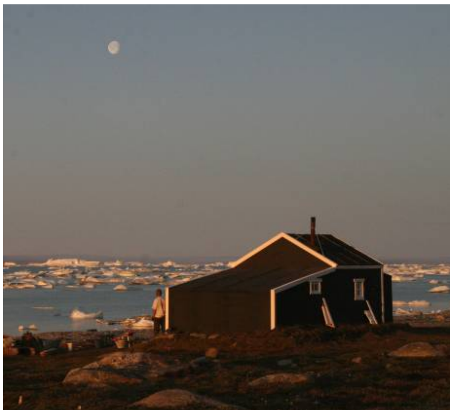
Summer evening at Ottostrand

During this Summer Nanok has succeeded in repairing another two old, North-East Greenlandic trappers' huts - Ottostrand og Laplace – thereby rescuing these historical buildings from total decay. Furthermore, one Nanok-team at Daneborg accomplished a much needed exterior renovation of Sandodden and also inspection of the historical collection in Hotel Karina. Read more of this in the report.