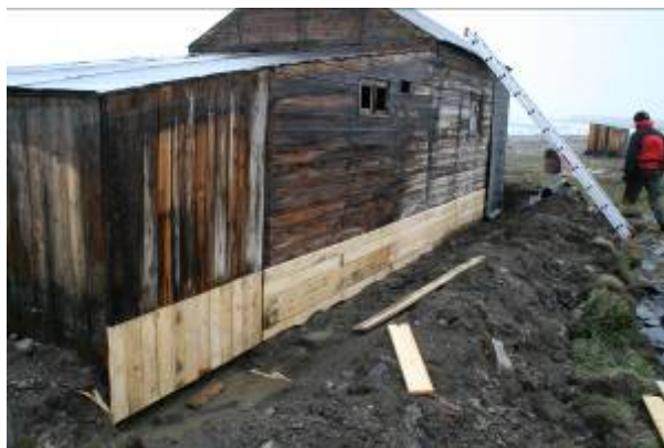
It was necessary to replace the lower part of the woodwork on the rear side of the house due to rot.