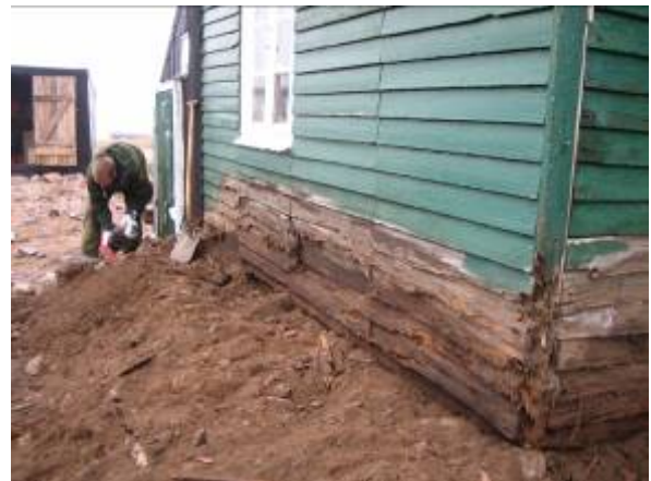
The stone wall in front of the western wall is removed and wet, rotten wall is exposed.