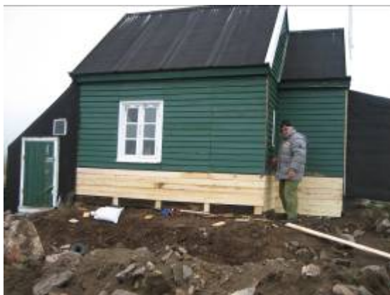
Left: The bottom part of the outer board wall is replaced and reinforced.

Immediately after arriving the weather changed to strong wind with rain for a couple of days. But with invaluable help from Sirius and their hydraulics, we managed to remove the stone wall in front of Sandodden in the western wall and a