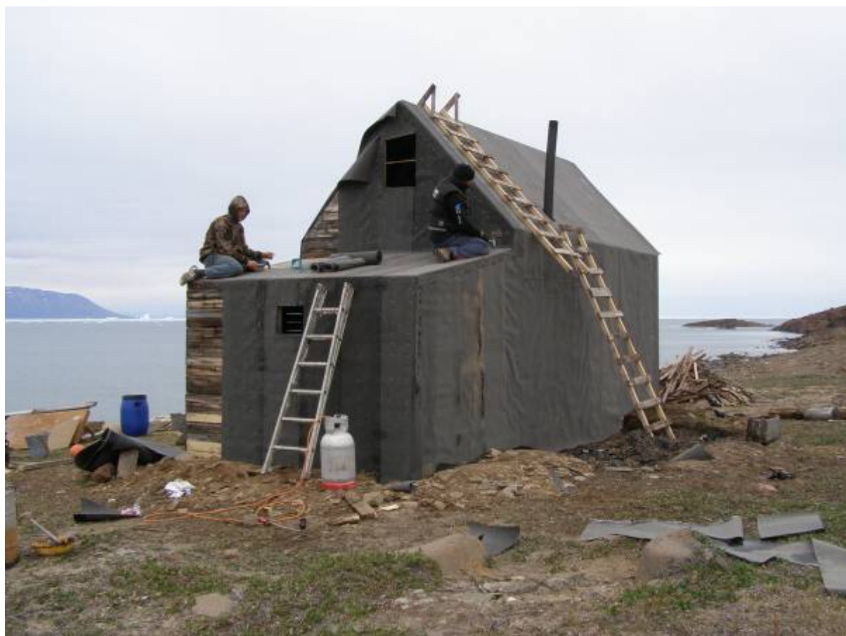
The inner felt is put on, one nail each 10 cm. That sums up to about 10,000 nails!

The following day Ole and Boye removed the remains of the porch on the south side of the station. Beneath the remains were four neat windows. Two were 100 x 100 cm, but without glass, and two were 100 x 50 cm with inserted glass. Coal of good quality also turned up in the ruins. The coal was put in the sacks we had brought with us. The coal